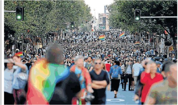
Crowds came out to celebrate the Yes verdict in Sydney on Wednesday.

Conscious of his electorate's twin records – highest Muslim population, highest No vote – Blaxland's Labor MP Jason Clare remains a steadfast Yes supporter, saying "I have been very up front with my com-